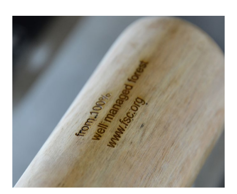
Marking on wood