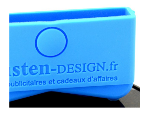
Non-contrasted marking on plastics