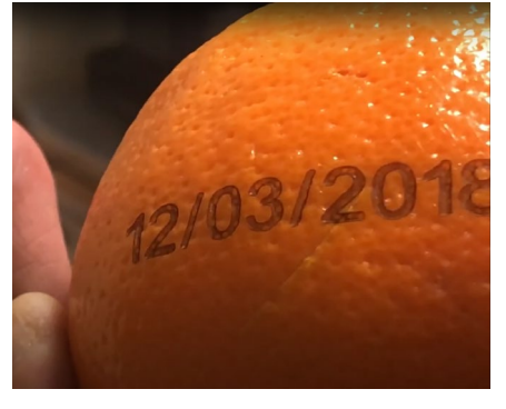
Fruits & vegetables marking