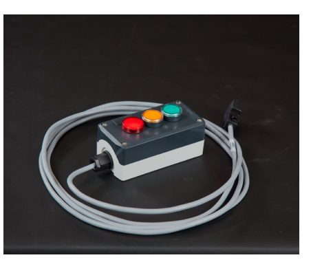
Process Control Box