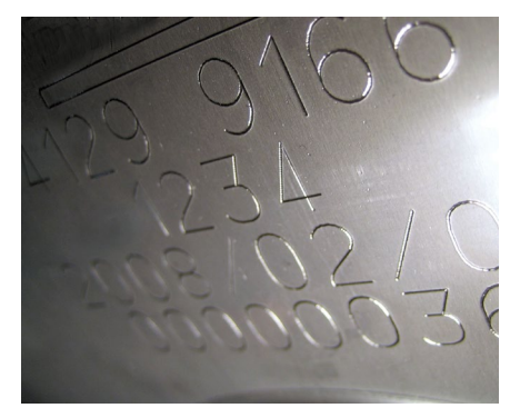
Stainless steel marking