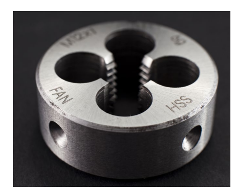
Marking tools for identification and equipment traceability