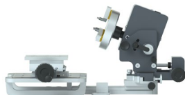
Cylindrical attachment & Rotary Devices

These accessories also deserve your full attention and can be covered by our after sales service. We cover the mechanical and electronic assemblies and repair or replace failed parts.