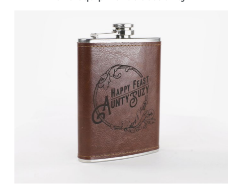
Gifts & personalization