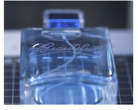
Cosmetics & luxury