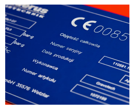
Traceablity of industrial parts