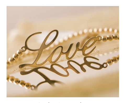
Cutting & engraving