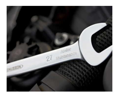
Marking tools for identification and equipment traceability