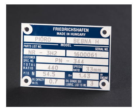
Marking tools for identification and equipment traceability