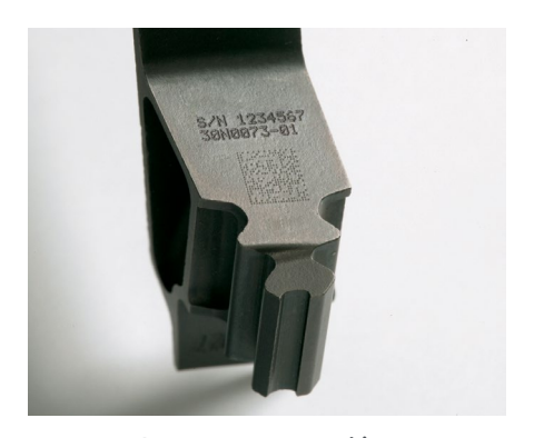
Aerospace part marking