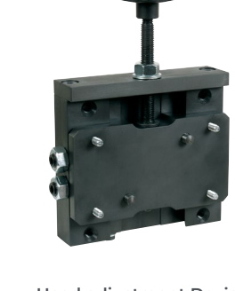
Head adjustment Device