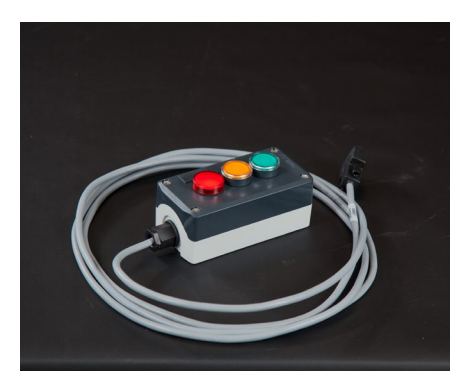
Process control box