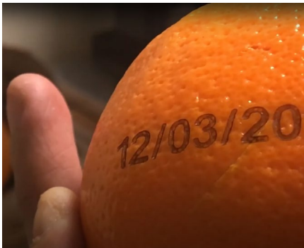
Fruits & vegetables marking