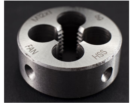
Marking tools for identification and equipment traceability