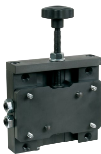
Head Adjustment Device