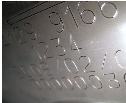
Stainless steel marking