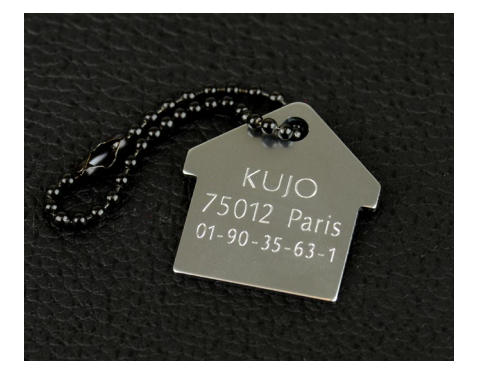
Pet and dog tags engraving