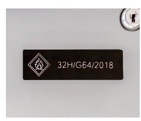
Marking tools for identification and equipment traceability