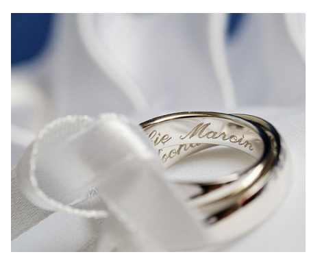
Personalizing and engraving jewelry