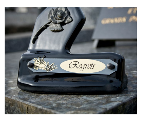
Funeral plaques and headstones engraving